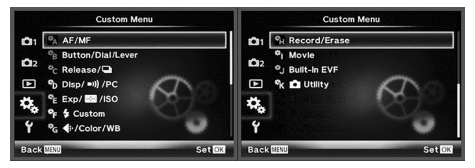
Cogs Menu Screens 1&2